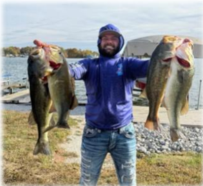
October 2025 Bass Classic

Camping is available to all members and their guests. Applications are available at the HLPOA Office. Single-night campers are expected to check in with the Campground Host.